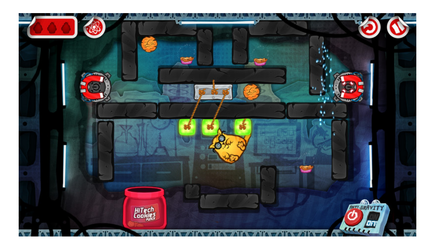
Download >>> <a href="http://bit.ly/2JZ1s3U">http://bit.ly/2JZ1s3U</a>